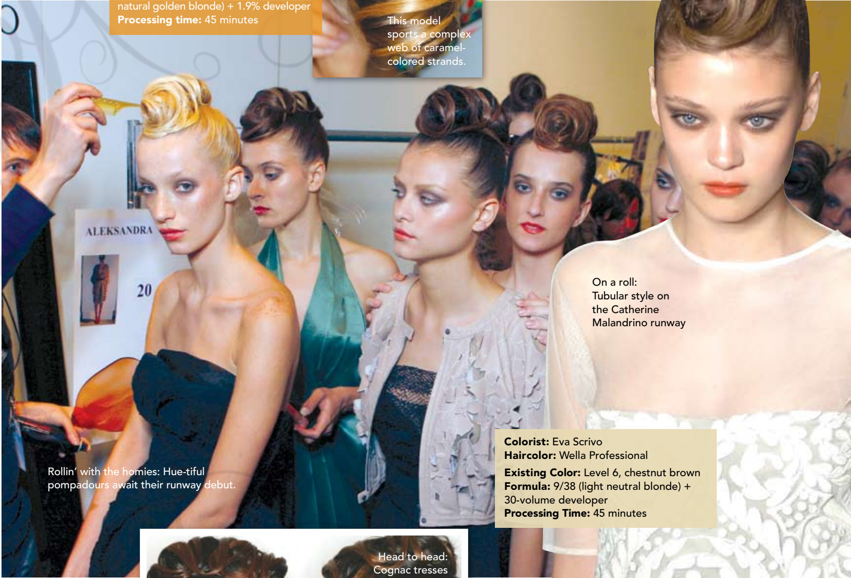
On a roll: Tubular style on the Catherine Malandrino runway

Colorist: Eva Scrivo Haircolor: Wella Professional Existing Color: Level 6, chestnut brown Formula: 9/38 (light neutral blonde) + 30-volume developer Processing Time: 45 minutes